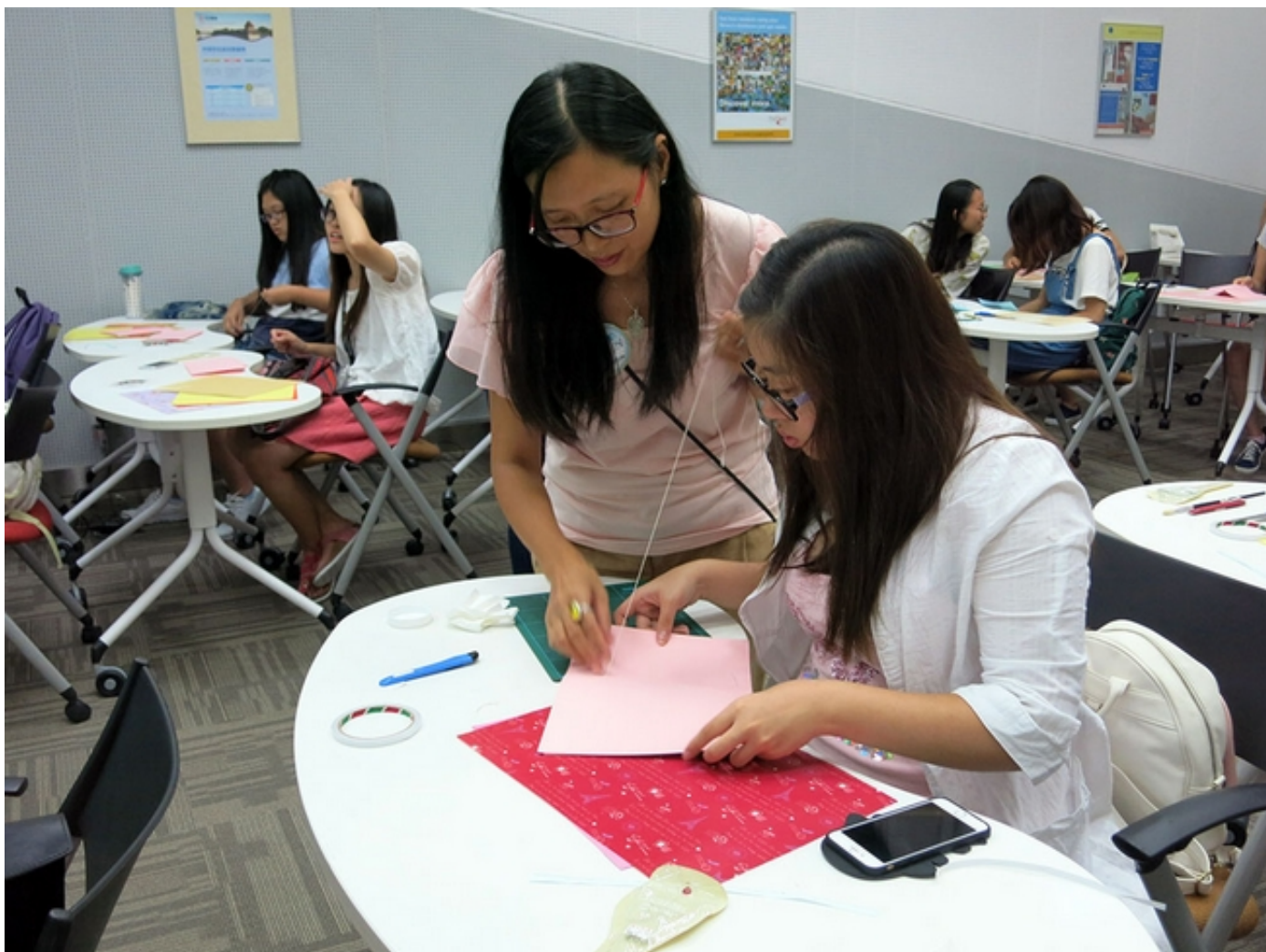
The teacher was showing the student how to sew a book. 導師正細心地示範如何縫製一本書。