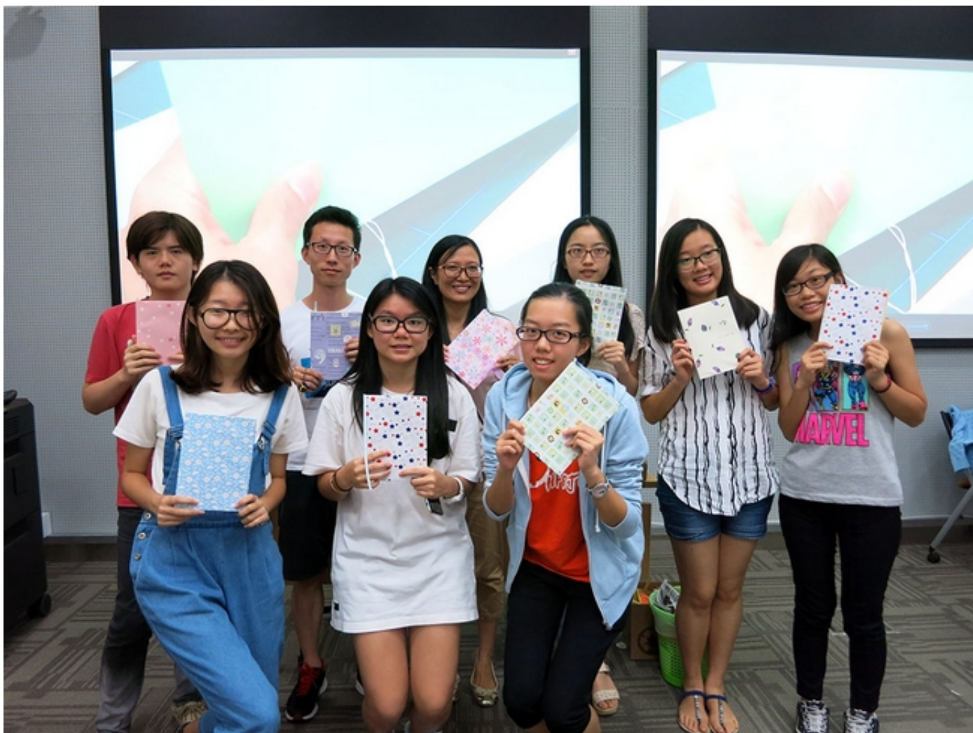
Students were satisfied with their works. 同學們很滿意自己的作品。