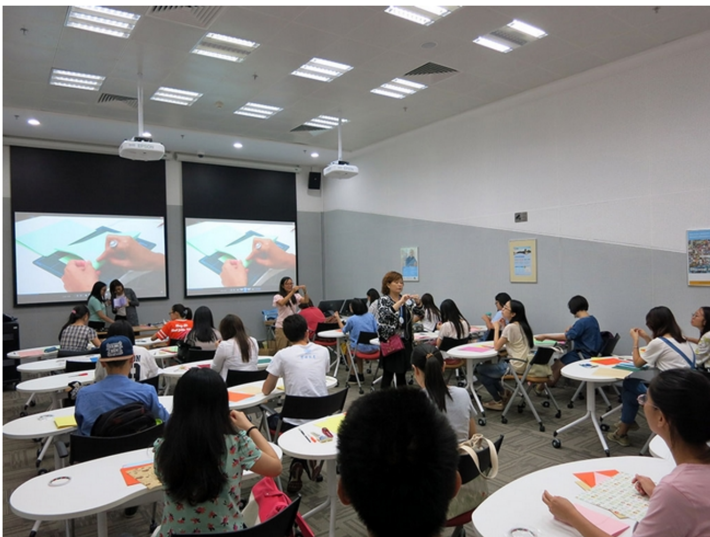
Handmade book workshop 手工書製作工作坊