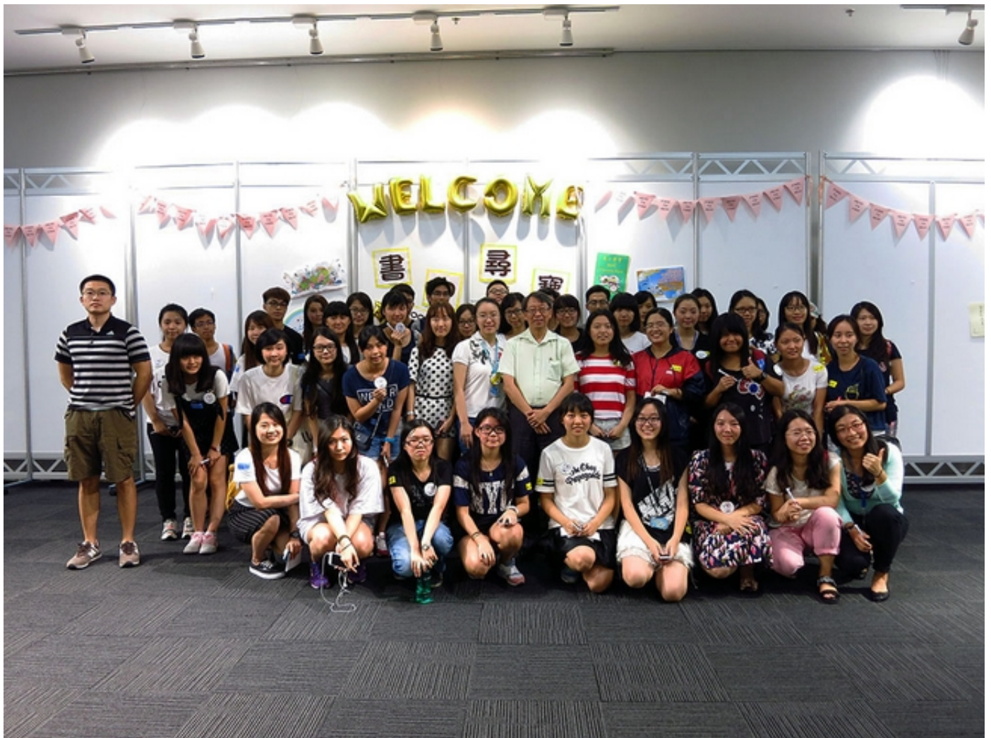
All the participants at the "Book Treasure Hunt" 「書中尋寶」所有參賽者大合照