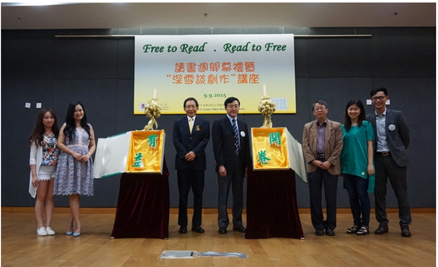
Opening Ceremony 開幕儀式